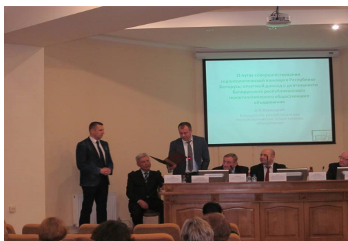
At photo: Diplomas for active participants for the realization of project of the creation of the therapeutic environment in nursing homes in the Vitebsk region

In 2014 – 2015 in nursing homes of the Vitebsk region of the Republic of Belarus was implemented the special approach for patients of nursing homes, which were divided into 3 groups – fit, vulnerable with cognitive impairment/impairment of mobility, and frail with partial/total decreasing of independence. For these groups was created a differentiated therapeutic environment - non-barrier environment in nursing homes, organization of free time, ergotherapy, using of computer devices, methods of moral support, education of patients, communication support,