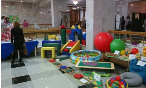
At photo: Exhibition with elements of the therapeutic environment in nursing homes in the Vitebsk region during the meeting

memory schools, etc. The rights of elders such as autonomy, dignity, and a high level quality of life in nursing homes increased due to low intrinsic capacity due to the creation of convenient surrounding environment which supports individually possible level of functional ability.