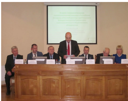
At photo: Greetings from the Social Ministry of the Republic of Belarus to activists of the Belarusian Republican Gerontological Public Association

On 20th November 2015 in Vitebsk was held the annual meeting of activists of the Belarusian Republican Gerontological Public Association. This meeting was dedicated to the results of the creation of a therapeutic environment which promotes independence and dignity of elders in nursing houses. The meeting of activists of the Belarusian Republican Gerontological Public Association was supported by the Social Ministry of the Republic of Belarus